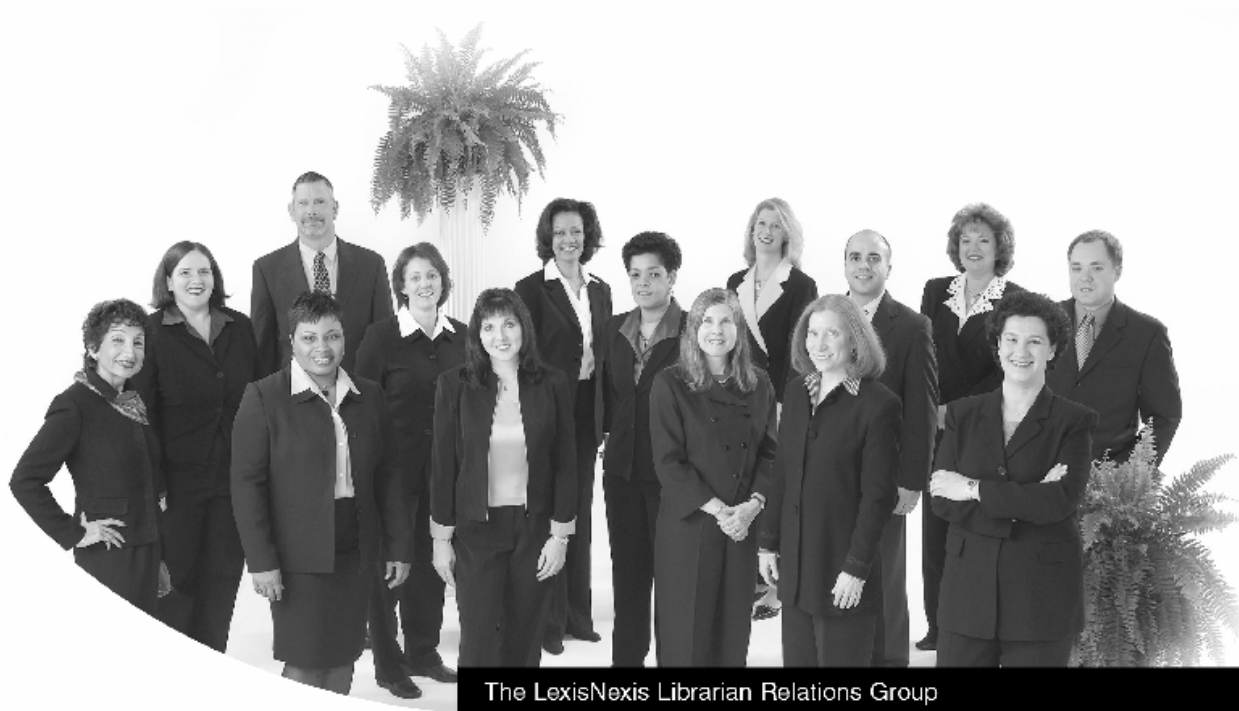
The LexisNexis Librarian Relations Group