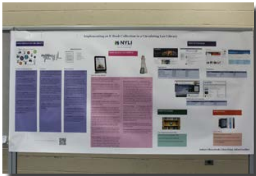
NYLI eBooks Poster Session